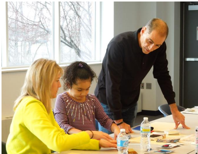
Working on Scrapbook pages for a Memory Book

After 10 years together, the mentor says that mentoring has really given him insight into some of the struggles of a growing child. Mentoring has made him more aware of the strong need for this type of relationship in our community and what a difference we can make.